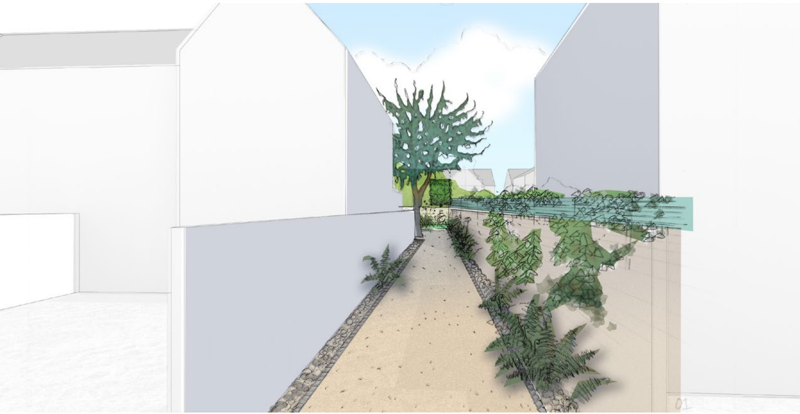
1 View from Entrance (West)