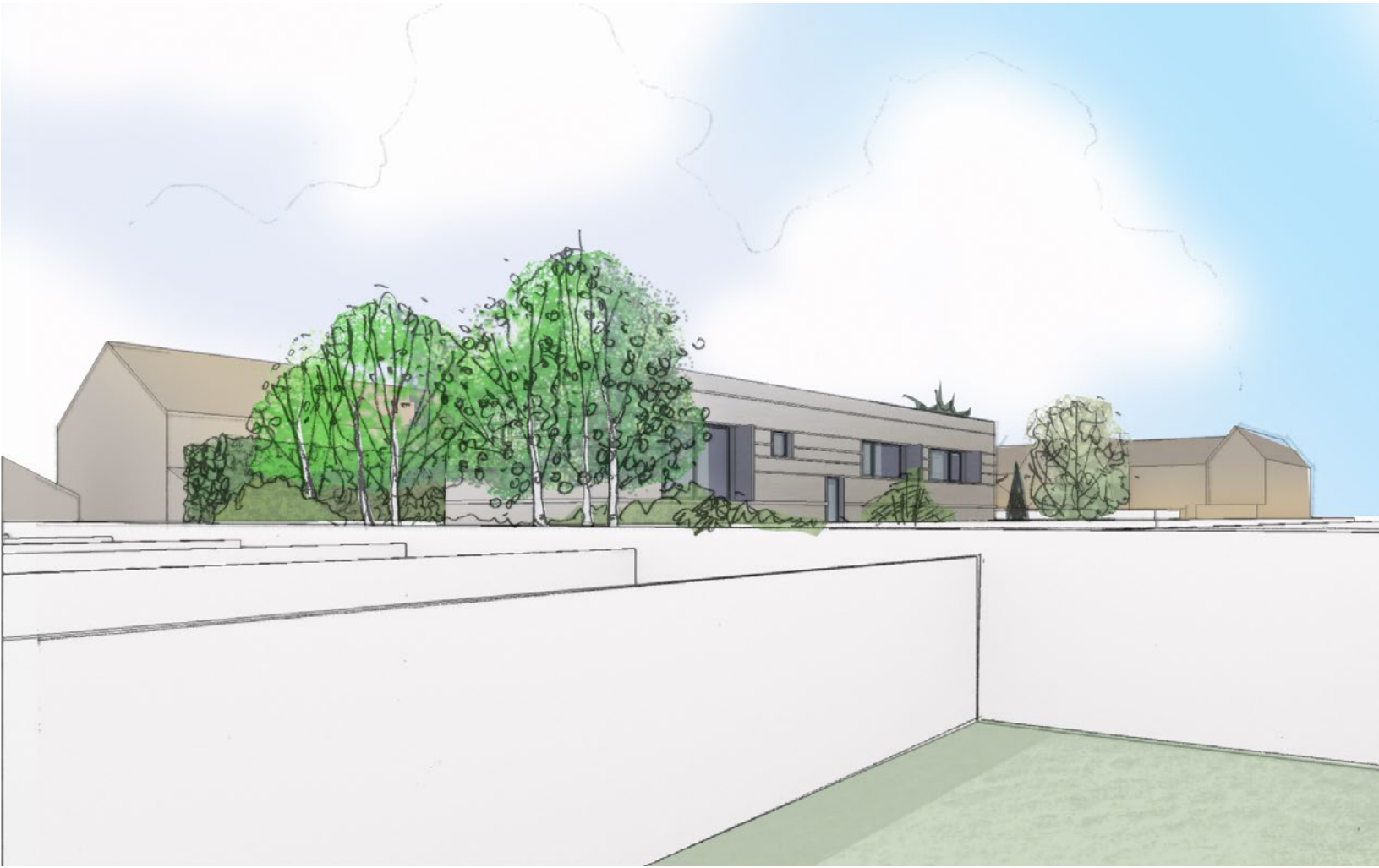
4 View from North-East