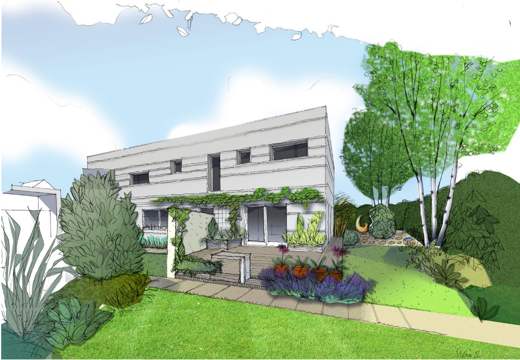
7 Family Garden View