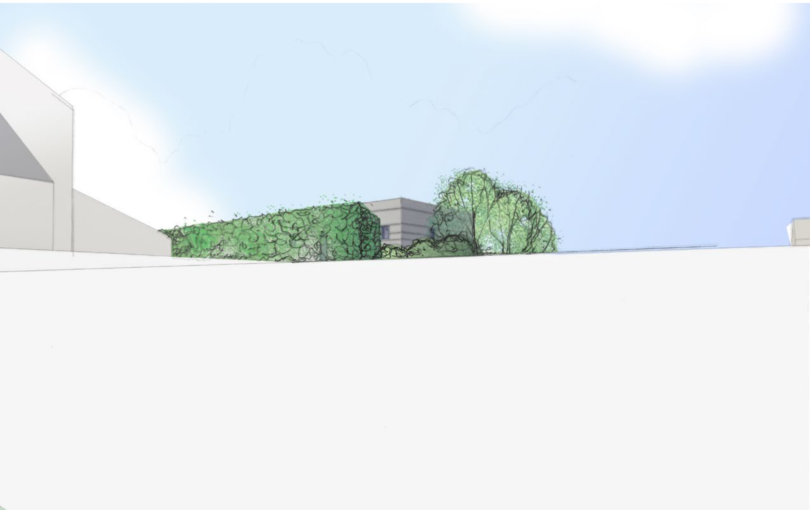
5 View from South-East