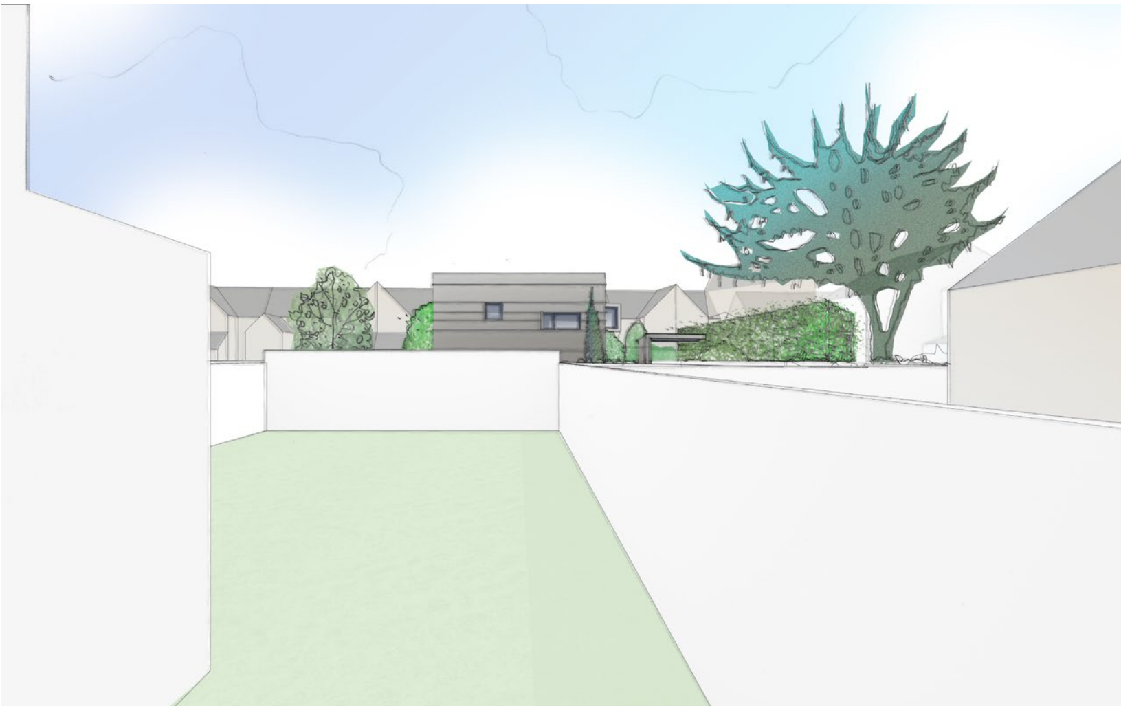
2 View from West