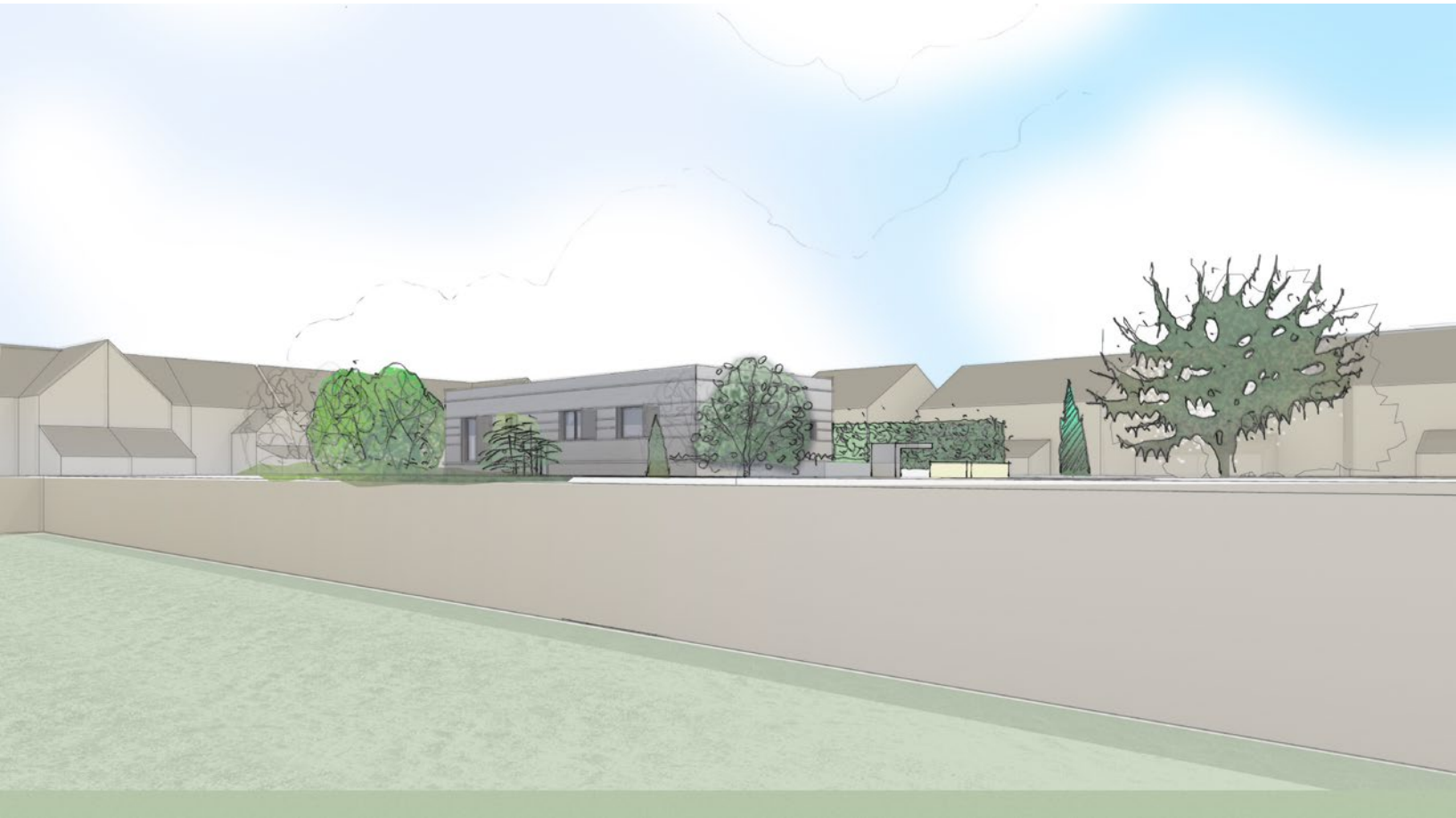
3 View from North